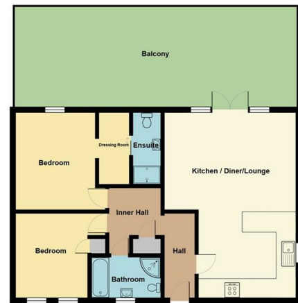
Apartment - Woodside View, 4, Hall Park Centre, Forest Drive, Lytham St Annes, FY8 4QF

Total Area: 80.0 m 2 ... 861 ft 2 (excluding balcony)